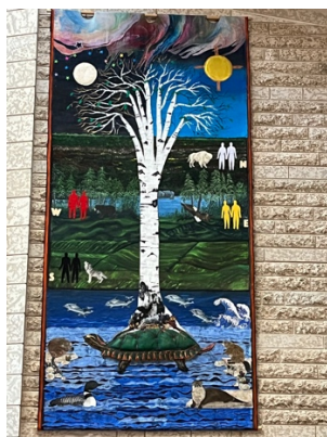
Creation Banner 2023