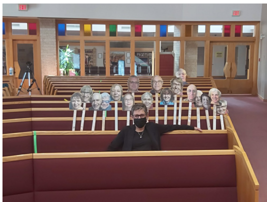
Welcoming our new Minister during COVID.