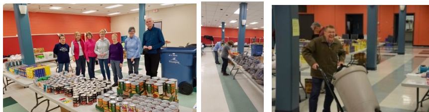
Portage Avenue Food Bank

We are a socially conscious and justice active congregation building on our originating churches' histories of supporting the United Church of Canada (UCC) Mission and Service Fund and other United Church Ministries in Winnipeg all of which Prairie Spirit has continued. PSUC is active in supporting outreach ministries in the city and other community justice issues such as homelessness, food insecurity and Indigenous reconciliation. We currently work with 1Just City which supports three inner city ministries, inclusive of Indigenous programming. We host the Portage Avenue Food Bank on behalf of Harvest Manitoba, provide significant support to the Canadian Food Grains Bank, regularly use Mission Stories in our services and have been active on the region's refugee initiatives. Within the St James community we attend meetings of the Neighbourhood Resource Network (NRN) which helps us to stay in touch with the activities of other nonprofits. It is our hope that in living out our faith and finding ways to address needs within our community, we will show that our mission is one of action.