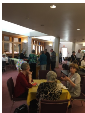
Coffee after service

As of January 2023, the Pastoral Care Team was folded into the Congregational Wellness Team. The Congregation Wellness Pastoral Care Team members maintain regular and as needed contact, through cards, phone calls and when possible, home visits with our congregation. This includes those who are ill, homebound, or suffering a loss. The team offers a prayer shawl ministry to share comfort and prayer with those they visit. Pastoral Care is a valued part of wellness within our Community of Faith.