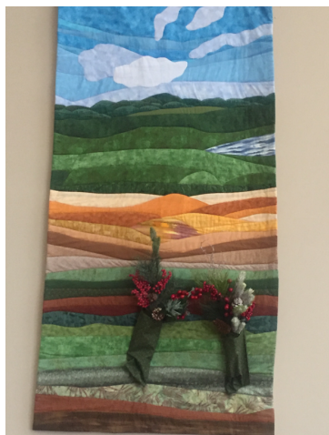
Our amalgamation quilted banner.