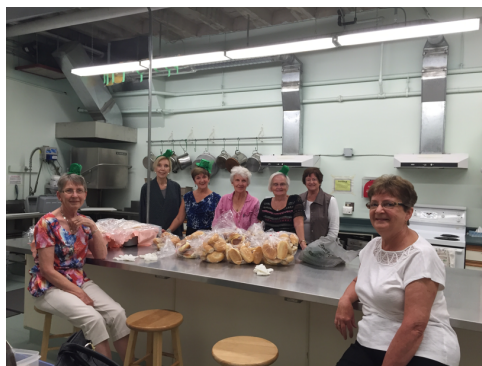
A portion of our meat pie team.